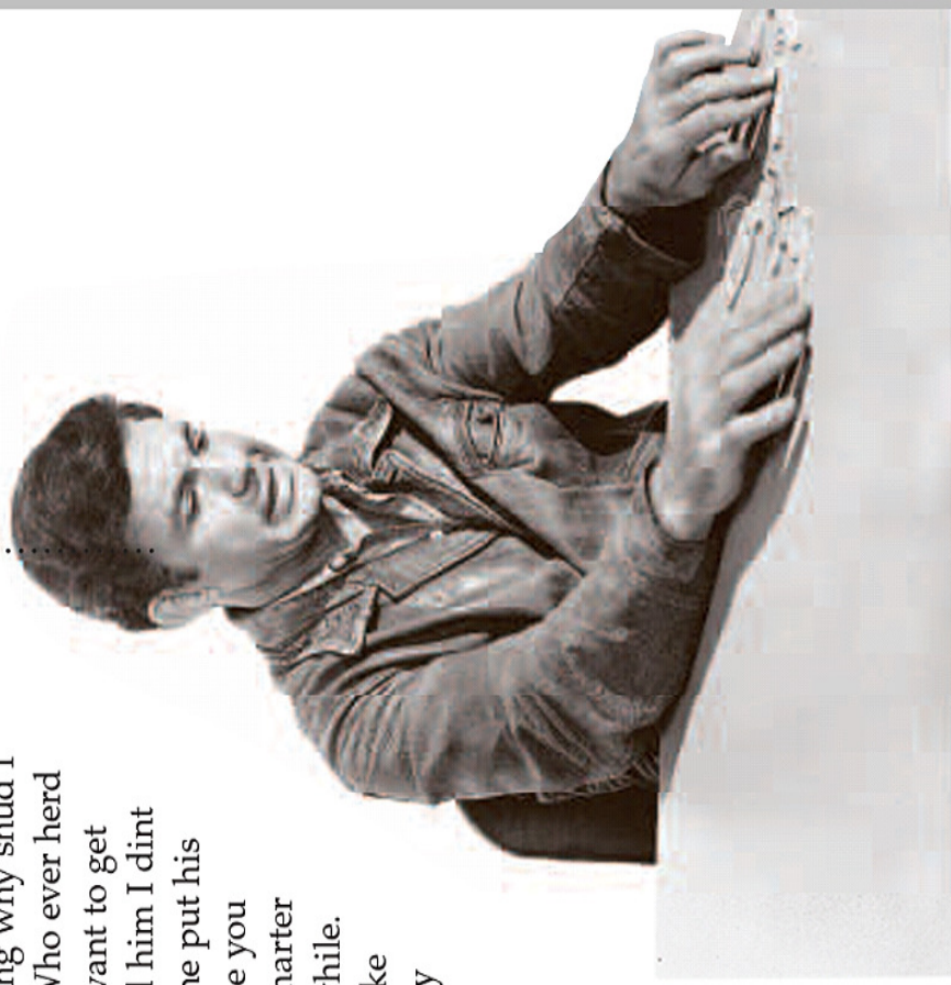
Charly, 1967. Selmur Productions. Movie still.

Making Inferences What do you think it means when someone says, "He really pulled a Charlie Gordon"? Support your inference with story details.